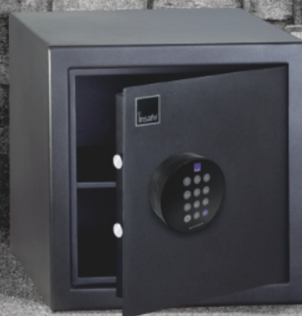
MODEL SHOWN: INSAFE S2 42E